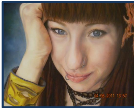
Juror's Choice Award Intermediate Award